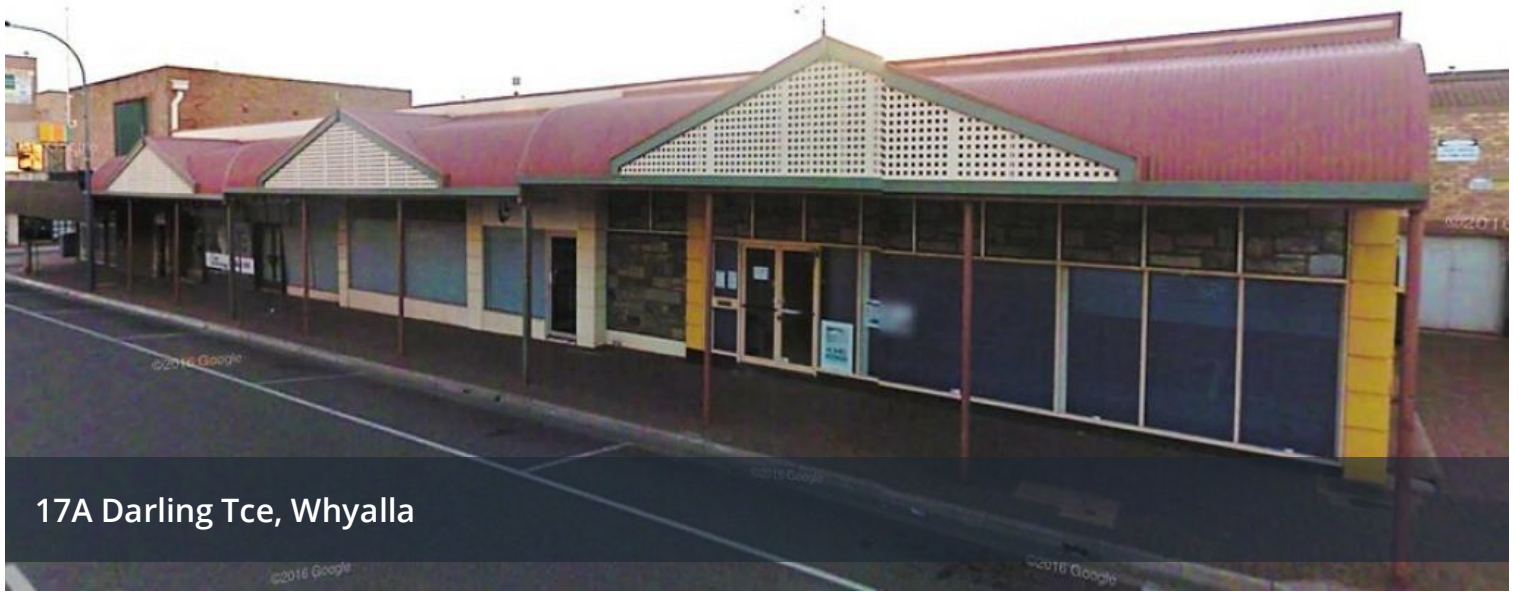
17A Darling Tce, Whyalla